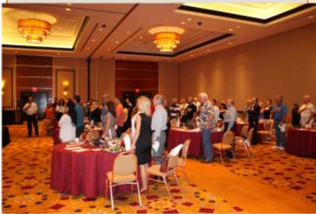
Attendees at the September Luncheon ready to hear about "Show Me the Money"